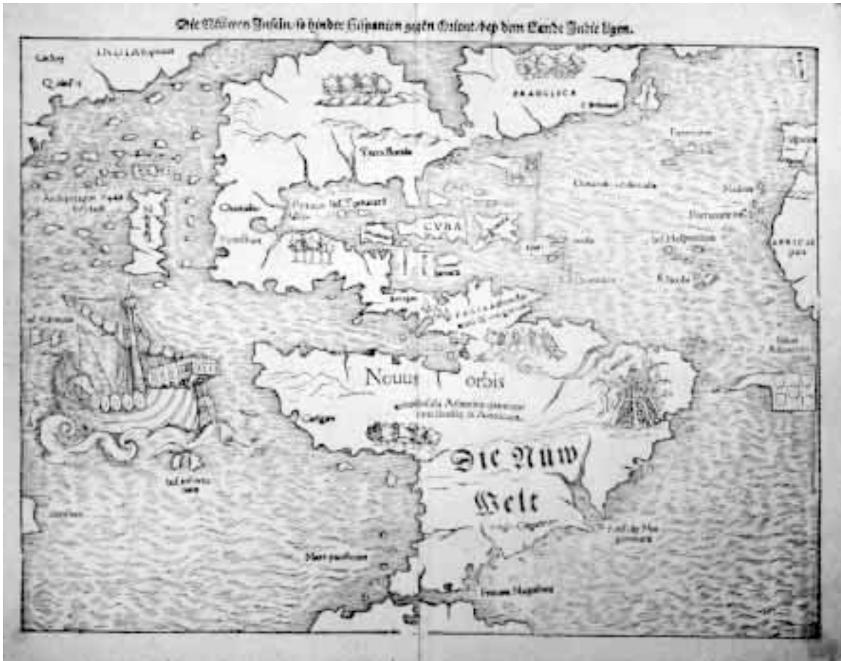
MAP OF THE NEW WORLD, SEBASTIAN MÜNSTER. NOVAE INSULAE, XVII NOVA TABULA, 1540, WOODCUT, JAY I. KISLAK FOUNDATION, INC. (CHECKLIST 13).

wrest profits from them and their land, traditional ways of life would be altered as old ways gave way to new. It was indeed a new world, one to which the native people of the Caribbean and Florida sought to adapt even while suffering the effects of rapid depopulation, the result of diseases introduced from Europe and Africa, forced labor, and other horrors of colonialism.