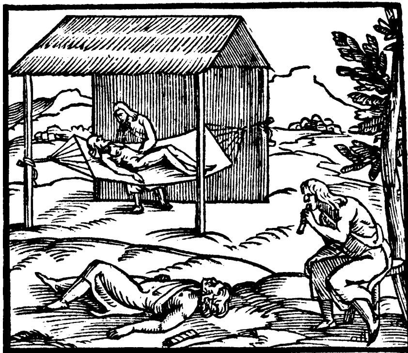
"NATIVES CARING FOR THE SICK." GIROLAMO BENZONI (D. 1528). LA HISTORIA DEL MONDO NUOVO , (1572), JAY I. KISLAK FOUNDATION, INC. (CHECKLIST 18).

On Hispaniola a fortified route was pushed through Taíno territory from La Isabela south to Santo Domingo to provide access to gold mines in the central portion of the island. Conflicts between