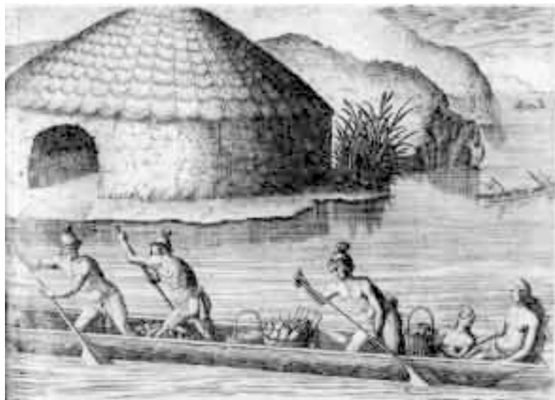
"INDUSTRY OF THE FLORIDIANS IN STORING THEIR CROPPES IN THE PUBLICKE GRANARIE." (SEE ILLUSTRATION CAPTION ON PAGE 17 FOR SOURCE INFORMATION.)

With his death in 1574 and the abandonment of Santa Elena in 1587, most of Menéndez's plans went for naught, including an attempt to employ Jesuit missionaries to convert Indians living along the coasts of Georgia and Florida. (The latter were the Calusa Indians on the southwest coast, the Tocobaga on Old Tampa Bay and the Tequesta at modern Miami.) The St. Augustine colonists saw the utility of using missions to bring Florida's 350,000